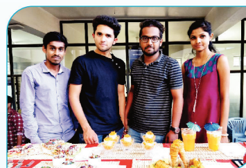
Management Day Competitions