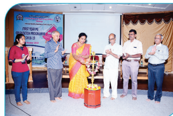
Orientation for 1 st Sem