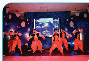
Utthana - UG Fest