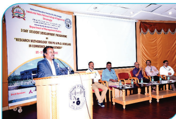
Student Development Program